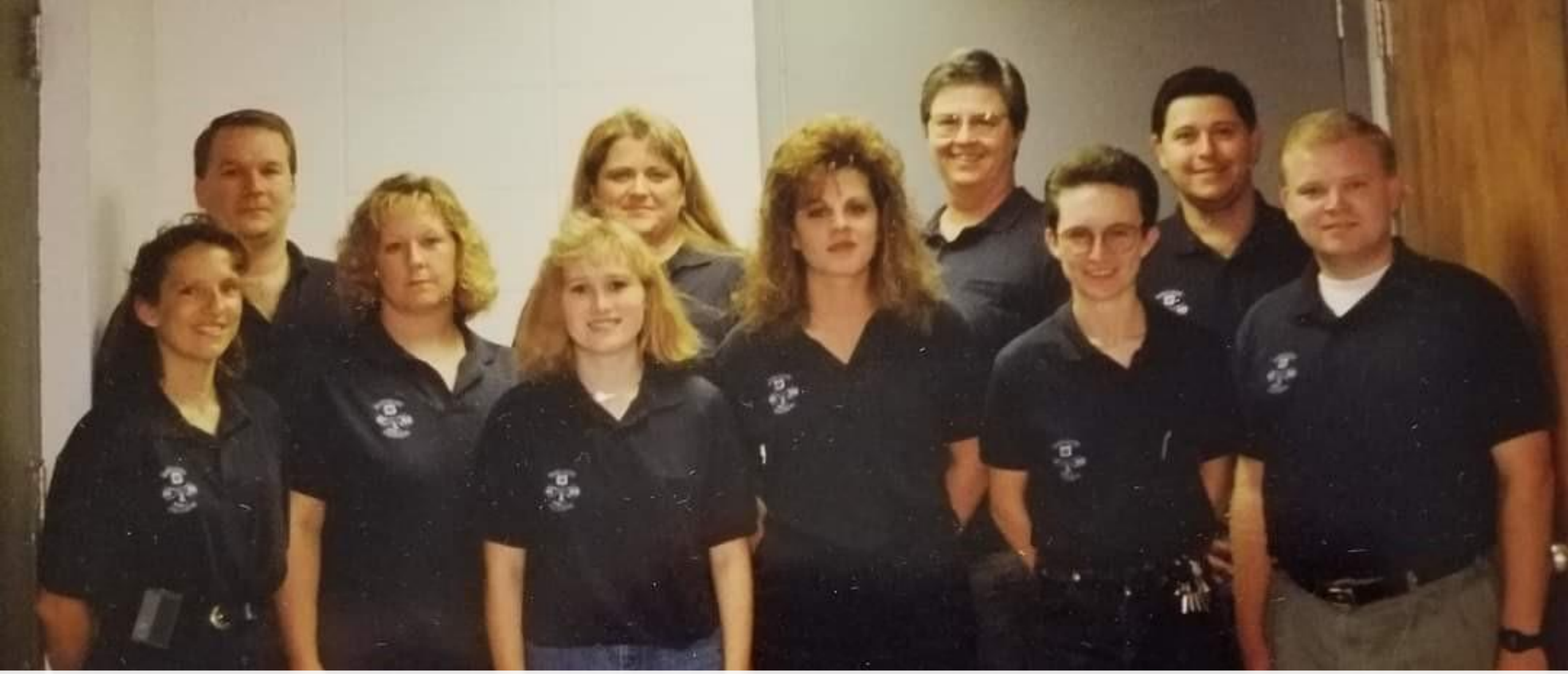
1994 Macon County 911 Dispatchers