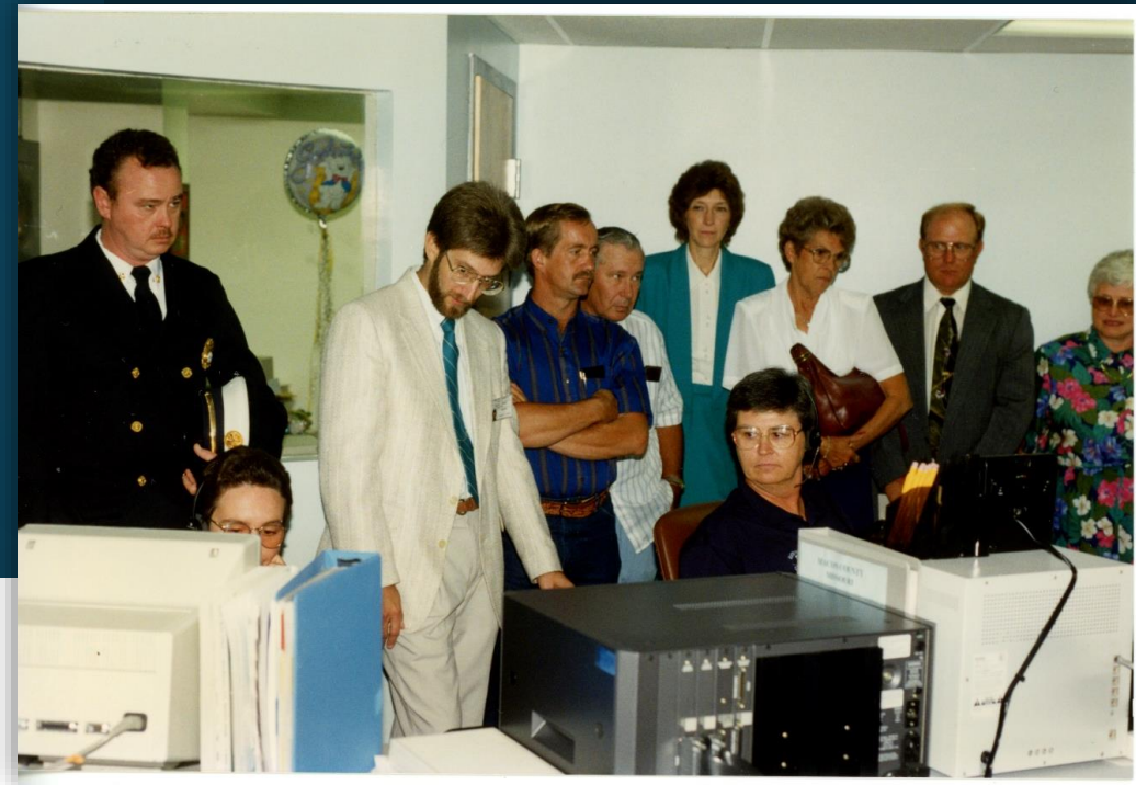
TOURING THE 911 FACILITY